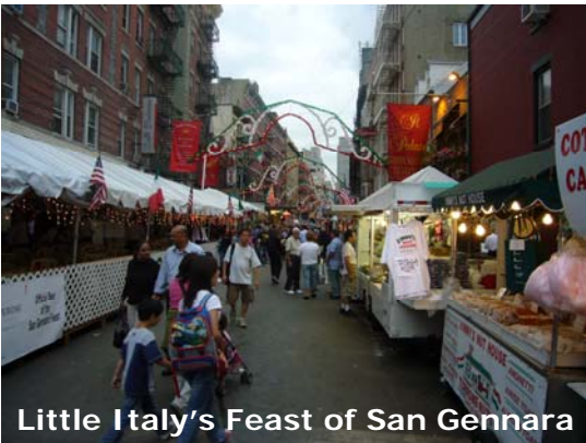
Little Italy's Feast of San Gennara