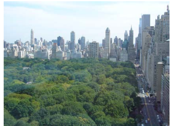
Central Park from Mandarin Hotel