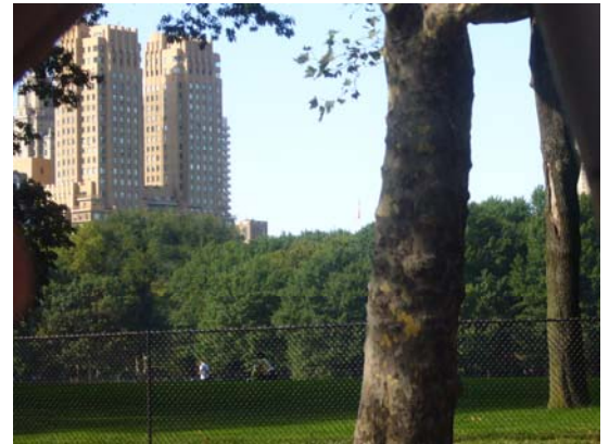
Central Park from our Hansom Cab

Our visit to New York City in September allowed us the unique pleasure of being able to attend the ' Feast of San Gennara ' in Little Italy held mid-September every year (the salute to the patron saint of Naples). The streets are blocked off for the festival and the neighbourhood comes alive with music and parades. Vendors are at every corner with souvenirs, games, Italian specialties and treats. The restaurants all have their patios decked out for the occasion and enjoying a meal of the best Italian food outside of Italy while watching the action on the streets is an exciting event. Memorial Day and Fourth of July musical groups and contests liven up the annual Sorrento Cheese Summer in Little Italy with food vendors lining the streets from Memorial Day weekend to Columbus Day weekend.