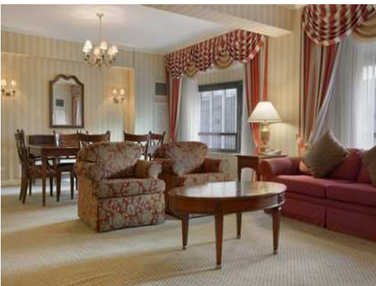
Executive Suite ↑Living Room & Bedroom↓