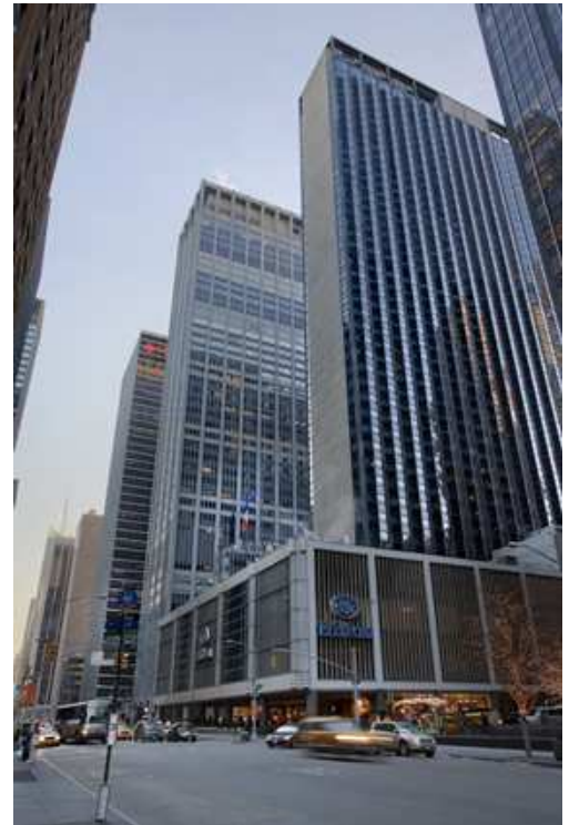
Hilton New York Hotel In the heart of Midtown Manhattan

In New York City you do not ever have to worry about waiting long for a taxi cab. Every second or third vehicle in Manhattan is a taxi and they are lined up outside the arrivals at LaGuardia. But – you will have to be patient getting from A to B. Traffic is always gnarled – so we settled in and enjoyed the sights on our drive from the airport to our hotel – The Hilton New York, Midtown , at 1335 Avenue of the Americas.