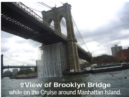
↑View of Brooklyn Bridge while on the Cruise around Manhattan Island.