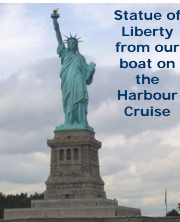
Statue of Liberty from our boat on the Harbour Cruise

Although I didn't take the boat tour to Liberty Island and Ellis Island on this trip, I did enjoy this excursion on my first visit to New York and highly recommend it to anyone visiting the Big Apple. You can take any mode of transportation from your hotel (taxi, subway or Gray Line bus) to Battery Park where the ferry boats leave for the islands. There are a number of different types of tours; some include visits to the Statue of Liberty and the Ellis Island Immigration Museum , some tours offer one island or the other, and there are boat tours that do not stop at the islands but offer some amazing photo opportunities as you sail around Liberty Harbor and Lower Manhattan . You can take your chances and go to Battery Park and line up for the next ferry boat leaving for a tour, or you can pre-book your excursion before your trip to New York. The choice is yours – but advance reservations are recommended because on busy days the ferries can fill up fast and you could be disappointed.