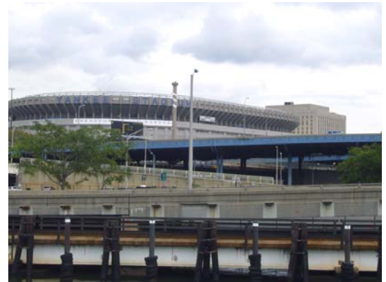
Old Yankee Stadium