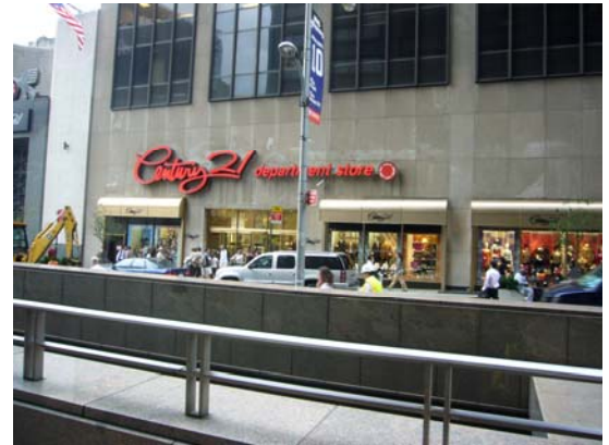
↑Century 21 Department Store Ground Zero taken from Pedway↓

The more reasonably priced department store, Century 21 , is located next to ' Ground Zero '. We viewed the area and activity of re-construction of Ground Zero from a viewing point on the pedway at the World Financial Center. The Museum on Liberty Street offers an Audio Tour that is informative and insightful. We had the sense that everyone passing by was sensitive to what had happened here – whether they were tourists or New Yorkers – and there was an overall feeling of quiet respect.