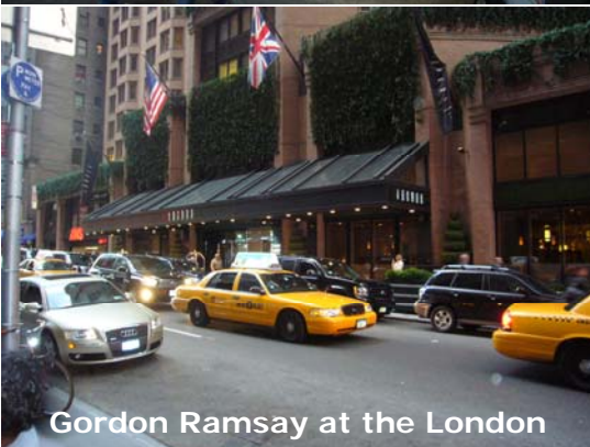
Gordon Ramsay at the London

This area of New York was the first home for thousands of Italian immigrants arriving from Italy at the turn of the century hoping for a better life in America. Old world traditions remain alive and if you haven't been to Italy – you will experience the next best thing right here!