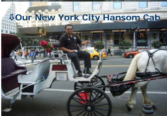
↓Our New York City Hansom Cab

On our second day in New York we took a taxi to the pier for a three-hour cruise around Manhattan Island . We saw all the sights on this cruise that circumnavigates Manhattan in its entirety. A tour guide offers commentary on the history of the island, important landmarks and, naturally, information about the celebrities that call New York their home. We passed seven major bridges including the Brooklyn Bridge, the five boroughs of New York and a grand photo opportunity of the Statue of Liberty. Beverages, food and souvenirs are available for purchase on board.